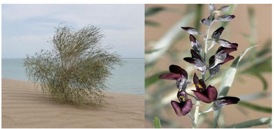
Fig. 2. Silver sand acacia (Ammodendron argenteum (Pall.) O. Ktze.

Reed or salt tree (Halimodendron halodendron (Pall.) Voss.) is a shrub specific to the desert (Fig. 3). It grows throughout Kazakhstan, except for the northern and northwestern regions. It grows in sandy and clay deserts, steppes, river valleys, channel coasts, near springs, often in salt marshes [10].