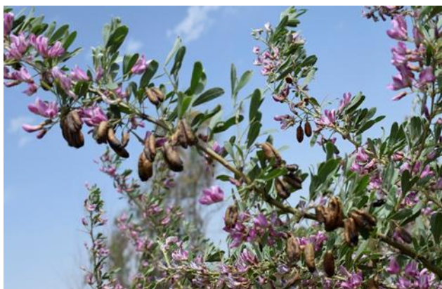
Fig. 3. Salt tree (Halimodendron halodendron (Pall.) Voss. – salt tree).

Reed or salt tree (Halimodendron halodendron (Pall.) Voss.) is a shrub specific to the desert (Fig. 3). It grows throughout Kazakhstan, except for the northern and northwestern regions. It grows in sandy and clay deserts, steppes, river valleys, channel coasts, near springs, often in salt marshes [10].